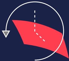
Backup & Recovery